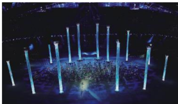
Sochi Winter Olympics lamppost display